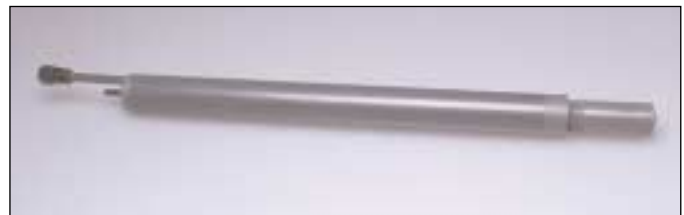
Geotech PVC Bladder Pump