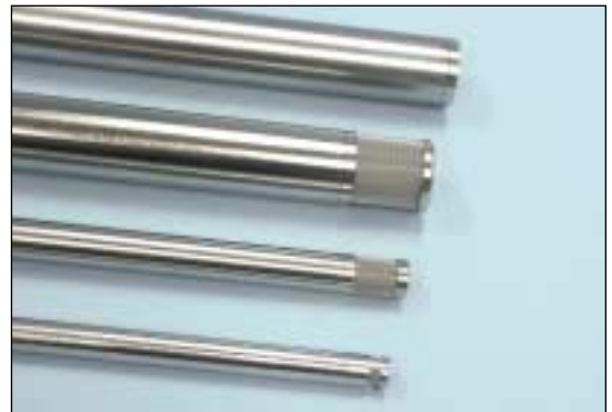
Geotech SS Bladder Pumps